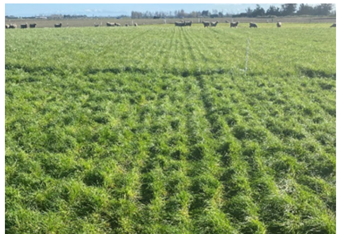
Newly established Reason AR37 perennial ryegrass. This paddock was taken through to seed production for our first Reason AR37 pre commercial seed.